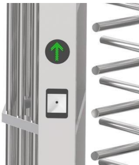
QR/Bar Code Solution