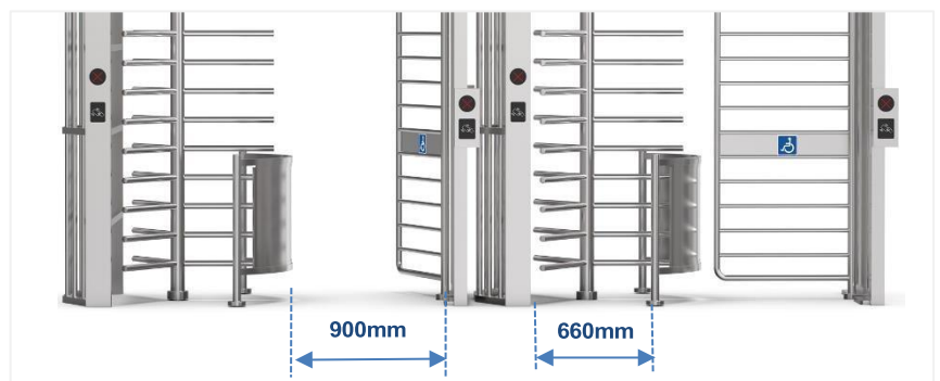
660mm For Pedestrian, 900mm For Wheelchair